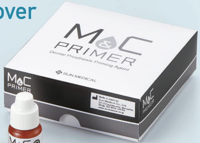
M&C=Metals & Ceramics

M&C PRIMER can effectively enhance adhesion to various substrates used for restorations.